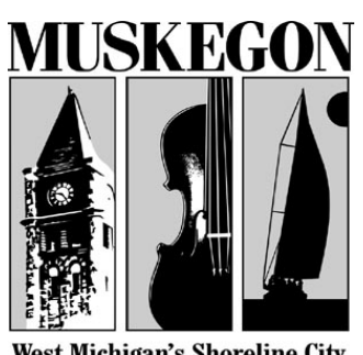
West Michigan's Shoreline City www.shorelinecity.com