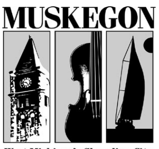
West Michigan's Shoreline City www.shorelinecity.com