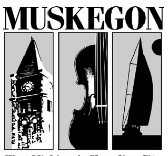
West Michigan's Shoreline City www.shorelinecity.com