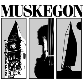
West Michigan's Shoreline City www.shorelinecity.com

Water Filtration (231)724-4106 FAX (231)755-5290